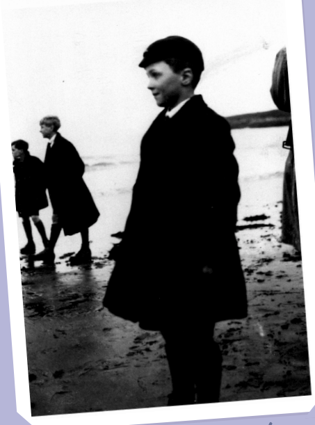
Roald Dahl on the beach at Weston-super-Mare.